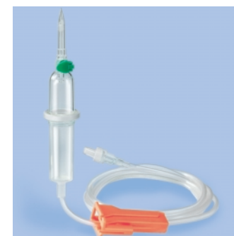
Intrafix® infusion sets