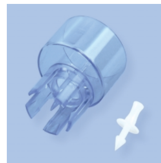
Ecoflac® Mix transfer cap

As part of the Ecoflac® plus assortment, we offer a wide range of accessories for easier handling in everyday routine. These include: