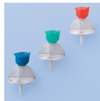
Mini-Spike® for multi-dose containers